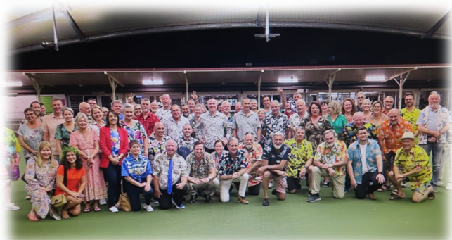
THURSDAY EVENING CELEBRATORY DINNER at the COOKTOWN BOWLS CLUB with a Tropical Shirt Theme to honour LAWMAC's 30 Years.

LAWMAC at the LGAQ Bush Council Convention in Goondiwindi.